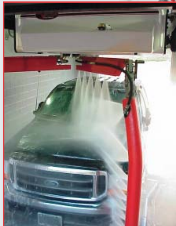
The wall mounted Vector provides an open and inviting clean bay appearance. Also available is a floor mount option.