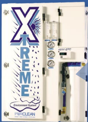
PROSERIES XTREME Wall-mount Spot-free System