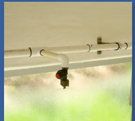
PROSERIES Window Rinse System