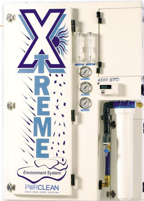
PROSERIES – XTREME